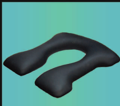
Standard Seating cushions built for comfort and durability.