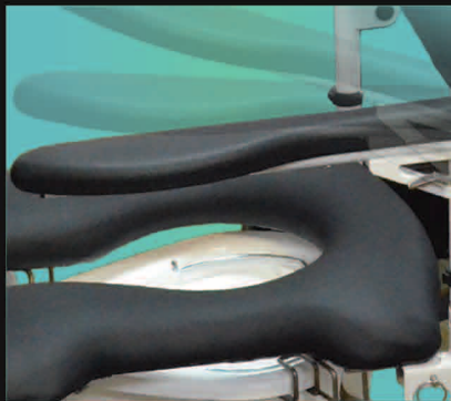
Comfortable, quick flip up arm rest